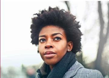
Economic Indicators for Women in Arkansas State, Region and County