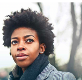
Economic Indicators for Women in Arkansas State, Region and County