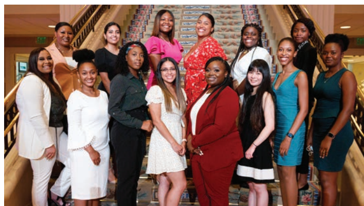
The program's closing reception and graduation was held at the Arkansas Governor's mansion.