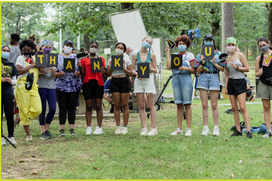
SHOOT DAY Filmmaking Lab participants pose for a group photo